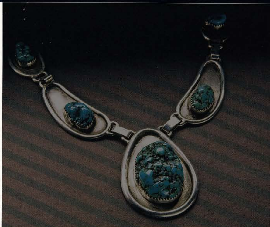
Untitled, necklace Lone Mountain turquoise, sterling