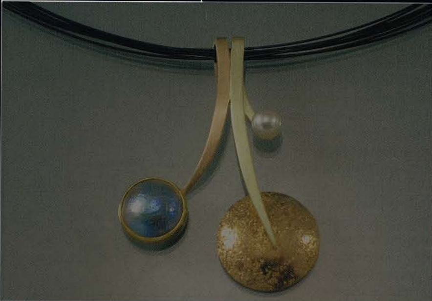
When Worlds Collide, pendant 14K yellow, red, and green gold, 22K gold, abalone pearl, Akoya pearl, steel neck cable