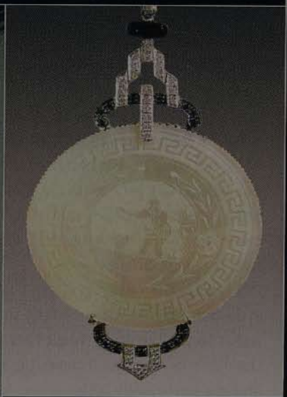
Untitled, pendant Hand-carved, antique mother-of-pearl gaming counter, 14K white gold, white and black diamond details, .60 cts. TW, black onyx accent, on 14K white gold chain.