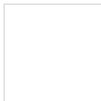
Inspiration :: Forehead Kiss