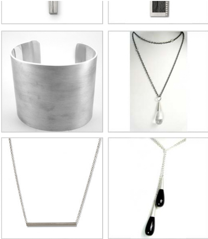
{left to right - row 1: cantilever ring, prenite ring ; row 2: cylinder dangle earrings on chain, double cylinder necklace ; row 3: centerpoint bar pendant silver, hematite pendant ; row 4: wide cuff, blackened quartz drop necklace ; row 5: cylinder bar necklace, black onyx drop silver lariat }