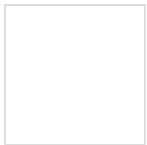
Twenty-Ten: No. 7 (February 13 - February 19)