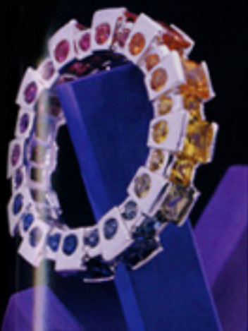
SPECTRUM'S BEST USE OF COLOR AND BRIDAL DIVISION, THIRD PLACE: FANCY COLORED SAPPHIRE AND PLATINUM BAND BY JEFFREY KUBNER, BALLERINA GEM CO., NEW YORK.