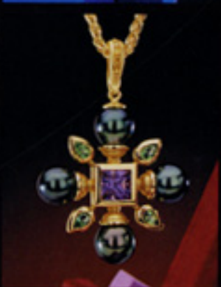
BUSINESS DIVISION, SECOND PLACE: INUITIAN PEARL CROSS PENDANT WITH TANZANITE, EMERALD, AND YELLOW DIAMONDS BY CATHLEEN BRUNT, CATHLEEN BRUNT FINE ART JEWELRY, KIHU, HAWAII.